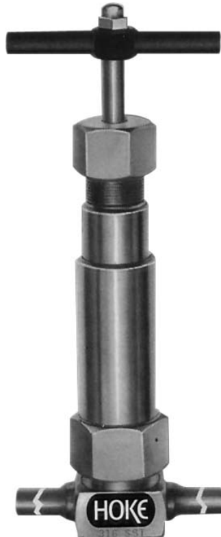
3" Tube extensions 4235Q6Y