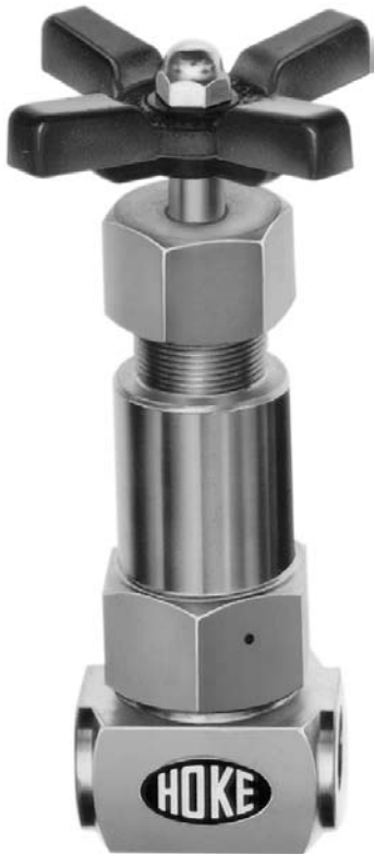
Pipe ended 4212F4Y

IT IS SOLELY THE RESPONSIBILITY OF THE SYSTEM DESIGNER AND USER TO SELECT PRODUCTS SUITABLE FOR THEIR SPECIFIC APPLICATION REQUIREMENTS AND TO ENSURE PROPER INSTALLATION, OPERATION AND MAINTENANCE OF THESE PRODUCTS. MATERIAL COMPATIBILITY, PRODUCT RATINGS AND APPLICATION DETAILS SHOULD BE CONSIDERED IN THE SELECTION. IMPROPER SELECTION OR USE OF PRODUCTS DESCRIBED HEREIN CAN CAUSE PERSONAL INJURY OR PROPERTY DAMAGE.