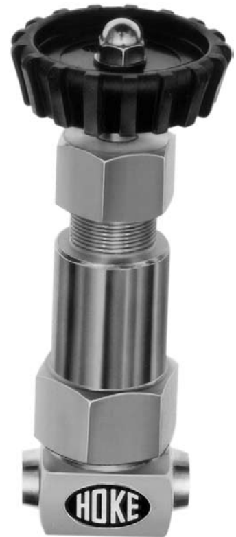
Socket weld 4251N6Y