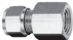
Fractional fitting shown

RG female thread ends require a gasket inserted into the flat bottom of the thread. The male end, when assembled, exerts pressure on the gasket, creating a seal.