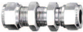
Fractional fitting shown