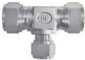
Fractional fitting shown