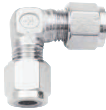
Metric fitting shown