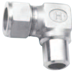
Metric fitting shown